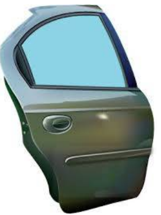
Fig.1: A car door

Sri Krishna College of Engineering & Technology, Kuniamuthur, Coimbatore-641008, Tamilnadu, India